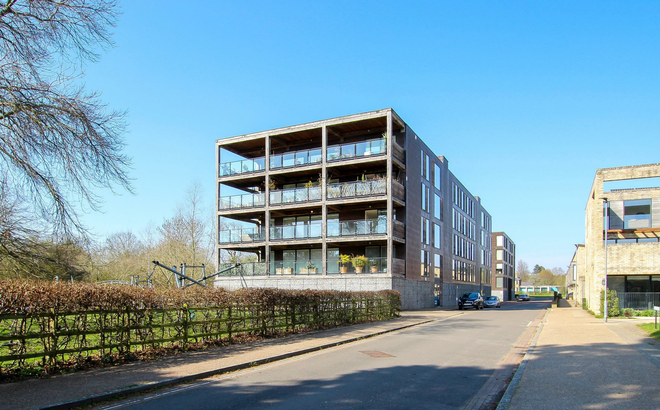
The Copper Building, Kingfisher Way, Cambridge, CB2 8BL